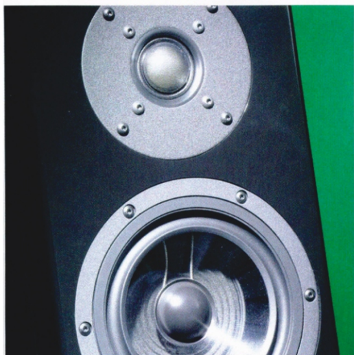
ABOVE: A hand-coated silk domed 28mm tweeter sits above the 150mm mid driver, on a 40mm Medite baffle

And so it was with Mozart piano Concertos No 21, K.467 [Sony SK34 562]. This is a delightful recording in which Perahia plays superbly, the softness of his touch well contrasted with the dynamics of the strings. The Baby Grand had the rare ability to make you stop, relax and marvel at what is being played. The silk dome tweeter never drew attention to itself and carried the same characteristic of composure as the mid.