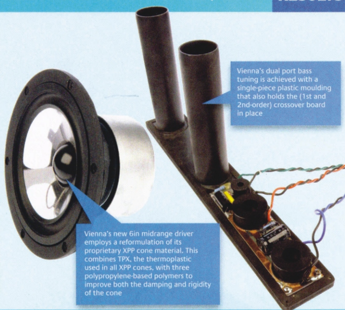
Vienna's dual port bass tuning is achieved with a single-piece plastic moulding that also holds the (1st and 2nd-order) crossover board in place