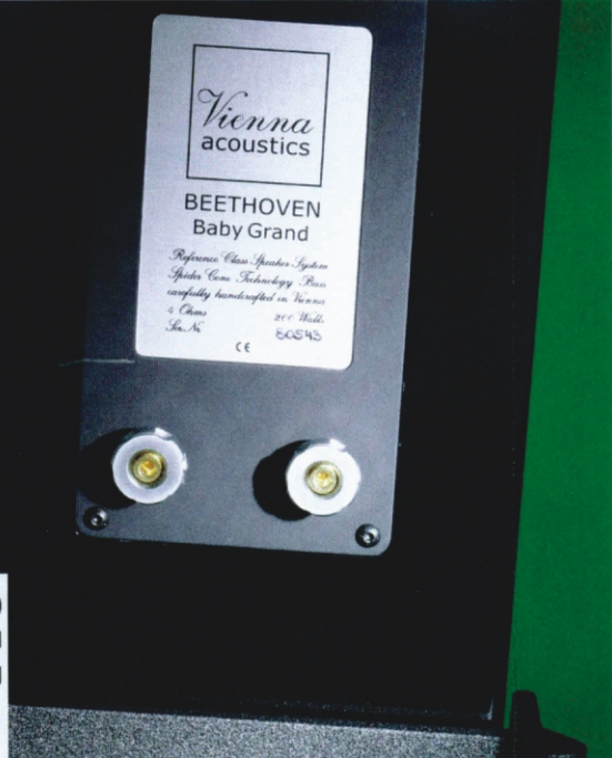
ABOVE: The Beethoven Baby Grand is designed for single wiring only via 4mm binding posts. Its decoupled base is spiked but comes with optional shims for wooden floors

the diaphragm is formed from TPX and strengthened with strategically positioned spider cone stiffening ribs, providing additional rigidity for bass transients.